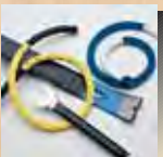
Marine, Sport & Tool Grips