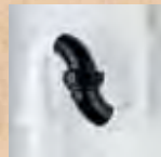
Plumbing & Air Ducts

To Order Call: 1-800-817-8968 FOR MORE INFORMATION: www.quickclampwrap.com